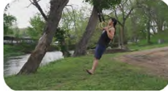
#2 - Assisted Squats

LEVEL 1: 2 Sets of 15 LEVEL 2: 2 Sets of 30 LEVEL 3: 3 Sets of 50