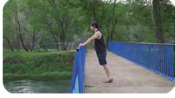
#2 - Adv. Knee Raises

LEVEL 1: 2 Sets of 20 LEVEL 2: 2 Sets of 30 LEVEL 3: 3 Sets of 40